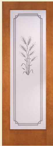
Harvest™ E631 Finished StainTru™ Pine