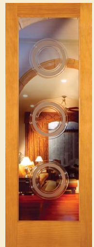
Radius™ G625 Finished StainTru™ Pine