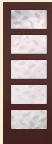
Five Panel Fossile™ L005 Painted PrimeAdvantage™