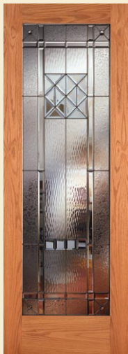
Indigo™ Z265 Zinc Finished StainTru™ Red Oak

Note: Always follow paint manufacturer's instructions for best results.